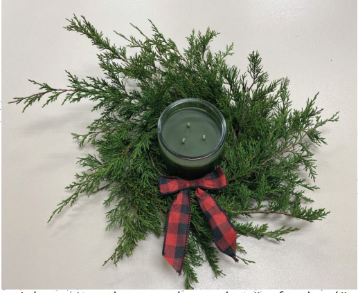
A homemade wreath can be "refreshed" each year to bring the scents of the holidays into your home.

Ask your child to package items and wrap gifts using reusable