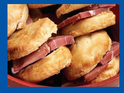
Don't Forget Due December 9, 2022

Holiday decorations don't have to be complicated nor expensive. This simple tree is made from a cinnamon stick and scrap ribbon. But if you would like a free kit to make your own decoration, stop by the 4-H office while supplies last. We are open Monday - Friday, 7:30am-Noon and 1:00pm -4:00pm CT.