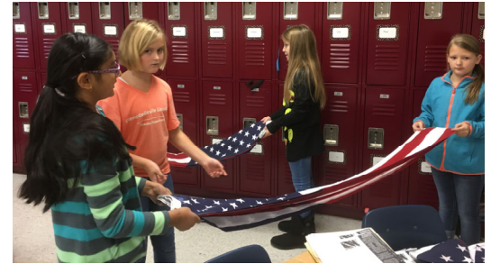
Youth learn leadership and meeting basics during 4-H led Club programs.

A community 4-H club has members and leaders from a defined geographic region like all of Green County. These clubs have a wide age range of members involved in a variety of projects and activities. Examples of community clubs include Cloverbud Club (youth 5-8yo), Horse, Nature, Shooting Sports, Livestock, and Science clubs.