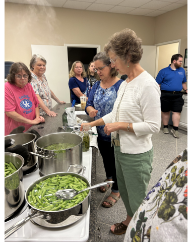
Educational programs of Kentucky Cooperative Extension serve all people regardless of economic or social status and will not discriminate on the basis of race, color, ethnic origin, national origin, creed, religion, political belief, sex, sexual orientation, gender identity, gender expression, pregnancy, marital status, genetic information, age, veteran status, or physical or mental disability. University of Kentucky, Kentucky State University, U.S. Department of Agriculture, and Kentucky Counties, Cooperating.