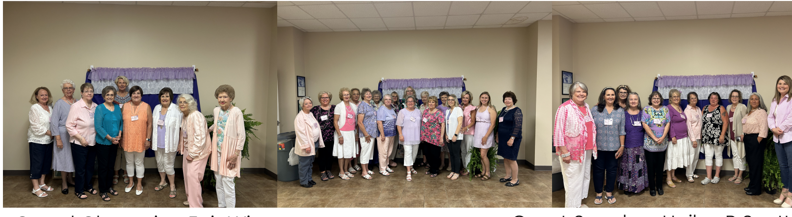
Grand Champion Fair Winners