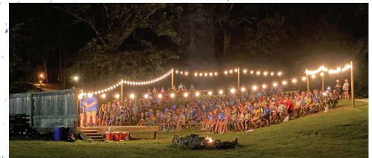
Closing campfire... the beginning of memories

4-H camps are open to all youth, ages nine through fourteen. Teens and adults can serve as a volunteer chap- erone; contact the 4-H office for more details and the volunteer forms.