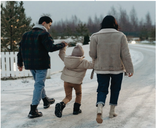
Winter Dash - Marathon Style

Find something you enjoy doing. Research shows that people who enjoy their physical activity have a better chance of sticking with it. Also, your activity does not have to