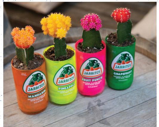
Upcycling can be as simple as using a drink container for your next flower project!

Inspect for Quality: Examine items for defects and wear, paying particular attention to high-stress areas and seams. You want to ensure that your finds are durable and will serve you well.